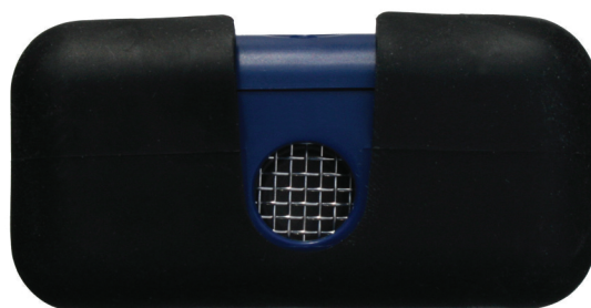
Ruggedized boot and Stand Included